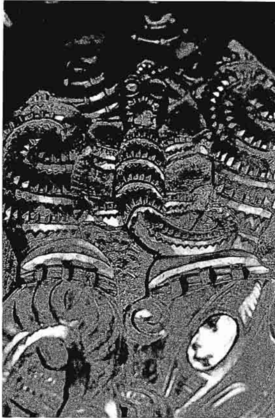
FIG. 2.—An example of Maori wood carving depicting a lizard-like animal (perhaps a gecko) with paua (abalone) eyes. This specimen is in the collections of the National Museum of New Zealand in Wellington.

Large lizards known to the Maori were the mokonui (Kerry-Nichols 1884; Best 1923), the kumi (Hector 1899) (believed by Hardy [1977] to be mythical), the ngarara (a 450 mm lizard from Kaiapoi in North Canterbury, Stack 1875) and the kaweau or kawekaweau reported from several areas of the North Island. All available reports of these lizards seem to be secondhand, and the characters attributed to the animals are often incongruous. In particular, the reference to the aquatic habits of the kawekaweau is surely inconsistent with all geckos and most of the known skinks of New Zealand. Indeed, many of the accounts of early settlers may refer to Australian agamid lizards (Hector 1899), such as Physignathus lesueuri , a large water-frequenting lizard.