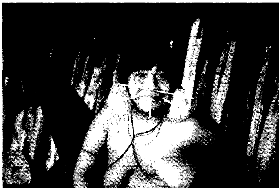
FIGURE 3.—Yanomamü woman with ear ornaments ( hoko siki ) made of fresh leaflets of Oenocarpus bacaba .

them sterile, weak, and very thin ( manakapë ). This sorcery might eventually kill the women. The bulbous root of manaka kēkī is mixed with little wooden pieces of the palms manaka ( S. exorrhiza ) or tharai ( Geonoma deversa ) and placed over the sleeping women. The mixture can also be added to a woman's food. Since the manaka palm is associated with the origin of women and fertility (Zerries and Schuster 1974) it is possible that there is a relationship between the black magic manaka and the manaka palm. Some men in Hasupīwei and Mokaritha claim that the manaka u , the sap of the palm, can cause the death of a woman when used in sorcery.