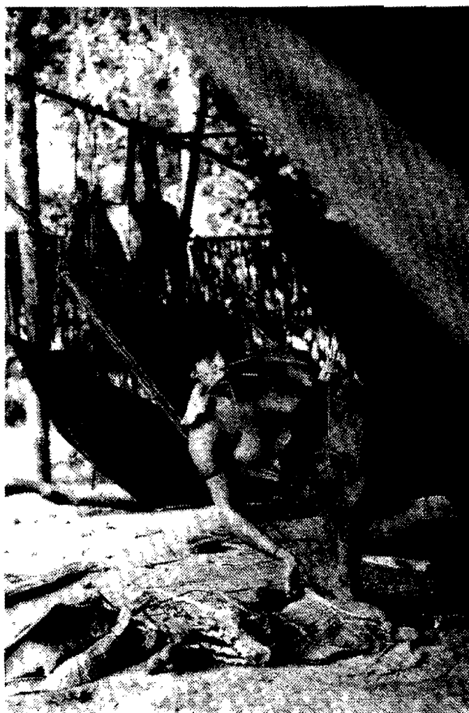
FIGURE 5.—Yanomamí woman preparing tobacco leaves, the fruits of Attalea sp. on the floor serve as occasional snack.

Yanomamí communities (Figure 6). The mesocarp is consumed because it has a pleasant taste and possesses a high nutritional value. According to Popenoe and Jimenez (1921), the cooked fruits contain 40.9% carbohydrates, 6.7% fatty acids, 2.8% proteins and 48.8% water. The nutritional value is more than twice that of plantains ( Musa spp.). This species does not appear to occur wild but is cultivated in swidden clearings throughout the Yanomamí territory. Reports about wild palms (Zerries and Schuster 1974) probably just concern old garden populations (Figure 7). This palm is usually grown in the older part of the garden, which is called the anus of the plot ( posi kě thēka ). Each palm might produce up to 120 kg of fruit per season. From January until March, when B. gasipaes produces most of its infructescences, the Yanomamí often invite neighboring communities to celebrate the reahu feast. The men prepare the rasha fruits for the guests. This feast