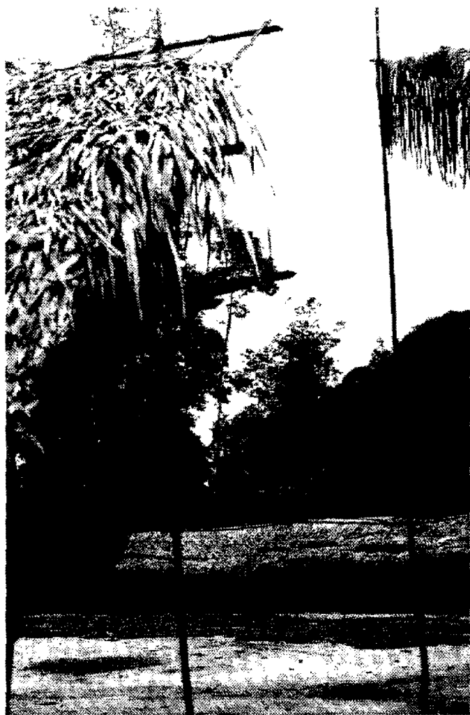
FIGURE 2.—Communal roundhouse with palm-thatched roof ( Geonoma spp. and Attalea spp.) in Hasupíwei.

products is an important tradition for subsistence during the treks. During migration or trekking activities the Yanomamí explore new habitats, which are sometimes distinct ecosystems with different plant species composition.