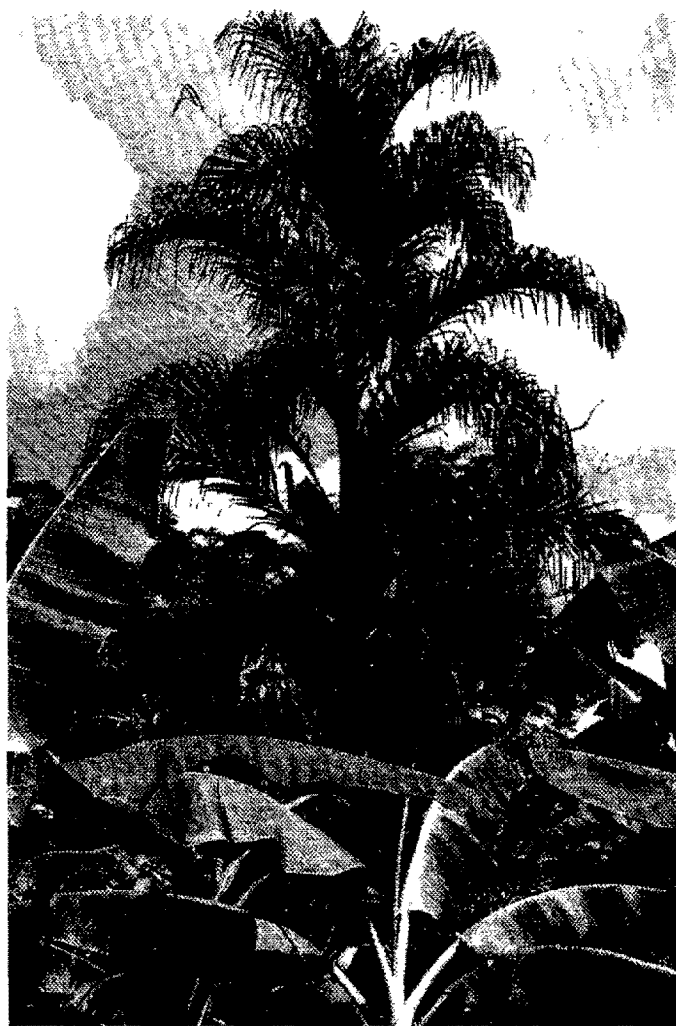
FIGURE 7.—Cultivated Bactris gasipaes palm of a garden plot in Irokai.

more frequently unarmed (Stauffer and Briceño 2000). The palm grows in large populations in nonflooded places in rain forests and is frequent to the south of the Sierra Unturán. The small fruits are occasionally eaten during long walks, mainly by women and children. In order to store the fresh snuff mass made of the seeds of Anadenanthera peregrina (Fabaceae) the men use miyôma leaves. The leaves are also used to make a kind of funnel for the preparation of curare. It seems that the leaves of B. simplicifrons are also most suited to store diverse products employed in sorcery. Women often wrap up the placenta of a new born child in the leaves of B. simplicifrons in order to make a package, which is hidden. In the past, the little fruits were used to make collars.