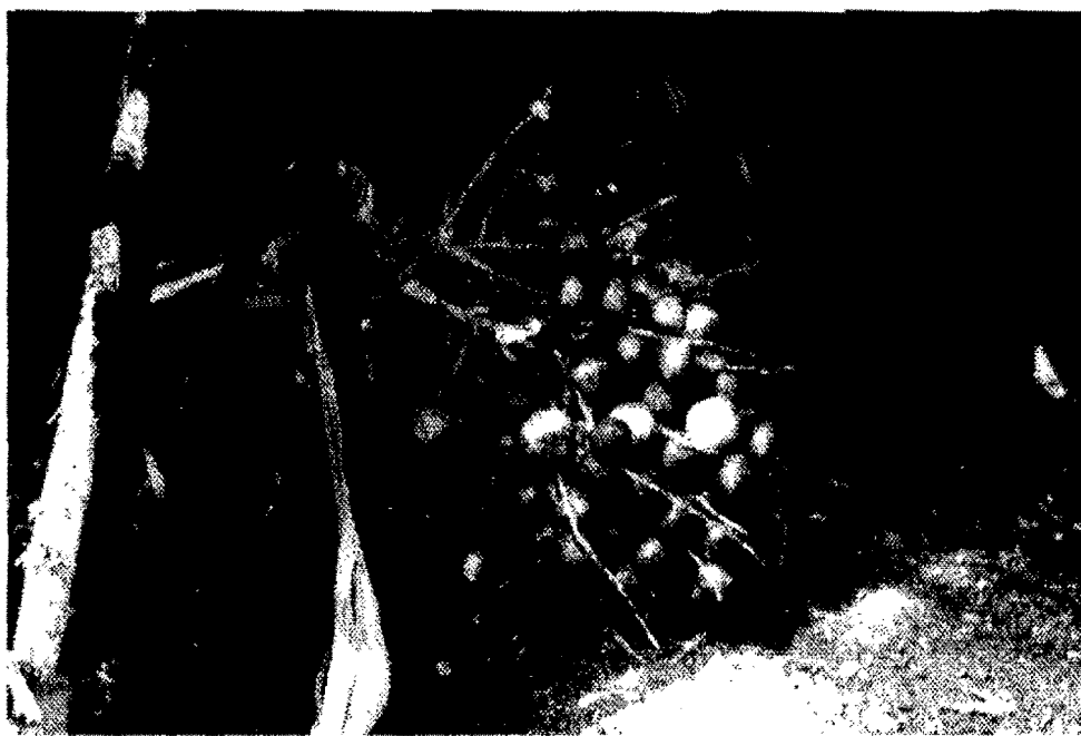
FIGURE 6.—Infructescence of Bactris gasipaes ( rasha ) ready for transportation.

is associated with funerary celebrations of related groups and strengthens the alliances between communities. Although rasha fruits play a certain role during reahu , it is not true that reahu is the feast of the rasha fruits as proposed earlier (Eibl-Eibesfeldt 1972).