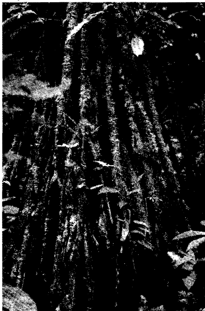
FIGURE 8.—Stilt root of Socratea exorrhiza ( manaka ), formerly used in the fabrication of hammocks.

mesocarp is prepared as a drink. The ripe mesocarp is also macerated in hot water for one or two hours. The resulting soup is consumed raw or cooked. The leaves are used to make provisional shelters within the communal house as well as walls for protection. For this purpose the leaves are woven together. The women make a kind of fan ( shuhema ) with the small leaves. It is used to fan the coals when making fire and also to sweep the floor. The leaves are used to wrap up the dead for transportation. The split petioles are used for weaving simple baskets that are employed (lined with leaves) to store food and to detoxify the cooked wapu fruits ( Clathrotropis spp.), which are soaked in water for several days.