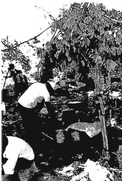
FIGURE 3.—Gratitude offering to god chaak . Note the plants used to construct the altar for the ch'a chaak ritual.

Trees are used for the altar where they put the cross and lay down the other implements (Figure 3). Among these trees are Bursera simaruba ( Chakaj "water stick"), Piscida piscipula ( ja'abin "the one which brings the water"), a tree that by its blooming announces the coming of the rains. It is also an indicator of the dry season, when its leaves fall. The bark of the balche' tree ( Lonchocarpus longistylus ) is used to prepare the sacred drink for the rite. Other trees have some specific use, such as good firewood, e.g., box catzin ( Acacia gaumeri ). Such wood burns fast and produces little smoke, important conditions for the preparation of the pib (food cooked in an underground oven made with stones). The earth oven must receive just the right amount of heat so that the pib neither tastes smoky nor is blackened.