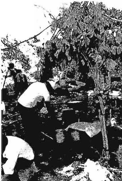
FIGURE 3.—Gratitude offering to god chaak . Note the plants used to construct the altar for the ch'a chaak ritual.

Trees are used for the altar where they put the cross and lay down the other implements (Figure 3). Among these trees are Bursera simaruba ( Chakaj "water stick"), Piscida piscipula ( ja'abin "the one which brings the water"), a tree that by its blooming announces the coming of the rains. It is also an indicator of the dry season, when its leaves fall. The bark of the balche' tree ( Lonchocarpus longistylus ) is used to prepare the sacred drink for the rite. Other trees have some specific use, such as good firewood, e.g., box catzin ( Acacia gaumeri ). Such wood burns fast and produces little smoke, important conditions for the preparation of the pib (food cooked in an underground oven made with stones). The earth oven must receive just the right amount of heat so that the pib neither tastes smoky nor is blackened.